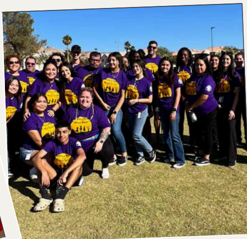
MONSTER MASH 2023