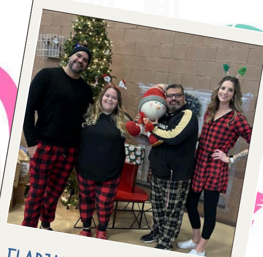
FLAPJACKS & FLANNELS 2023