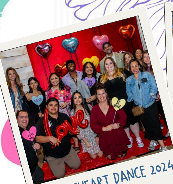
SWEETHEART DANCE 2024

OUR TEAM THANKS YOU FOR ALWAYS SUPPORTING HOLLYWOOD!